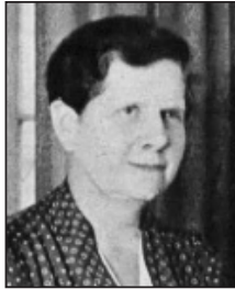
Judge Florence E. Allen

During the Great Depression, the natural effect of economic measures that treated women differently from men was that women would benefit least or would be the first to suffer. The federal Wages and Hours Act of 1938 was, therefore, a signal achievement for women. As originally proposed, it would have provided lower minimum wages for women than for men. Concerted action by NAWL and other national women's organizations resulted in the elimination of this provision. A second example of successful legislative work was defeat of a 1939 California bill known as the "Spouse Bill." It would have prevented employment of married women in public offices or as teachers if the joint income of hus-