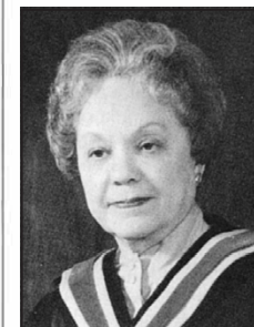
Juanita Kidd Stout