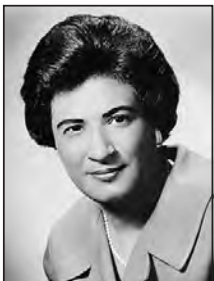
Constance Baker Motley